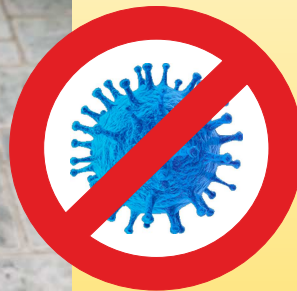
Handy and easy to carry