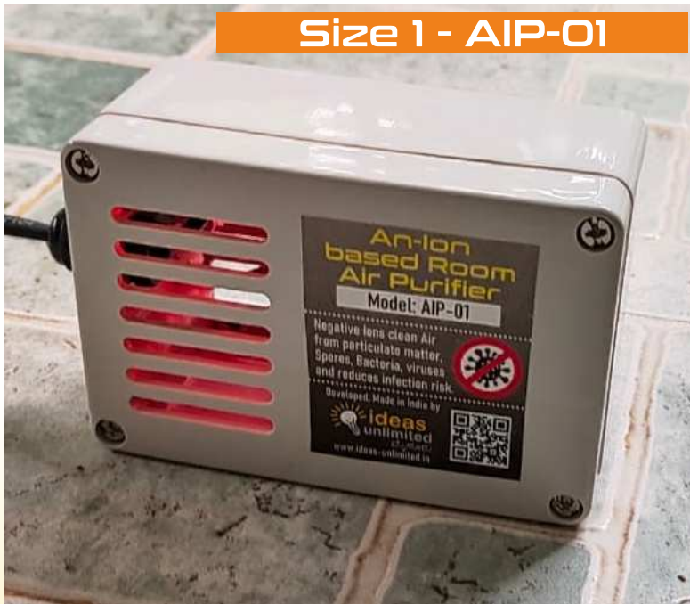
Size 1 - AIP-01

Carry this handy and low power consuming Air Purifier wherever you go!